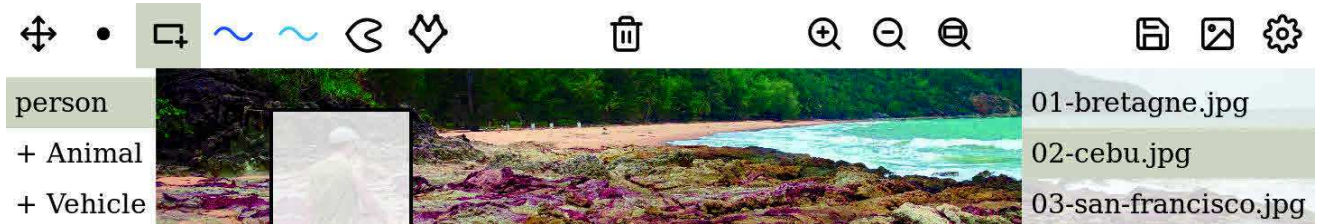
Figure 1: Screenshot of the interface of our image annotation Web application.