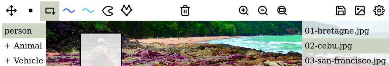
Figure 1: Screenshot of the interface of our image annotation Web application.