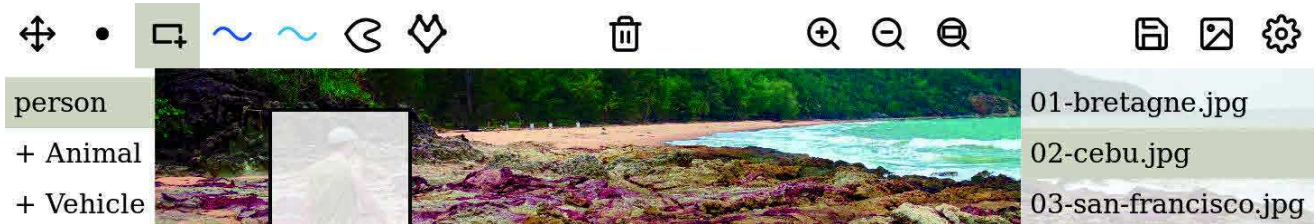
Figure 1: Screenshot of the interface of our image annotation Web application.

Vincent Charvillat University of Toulouse vincent.charvillat@irit.fr