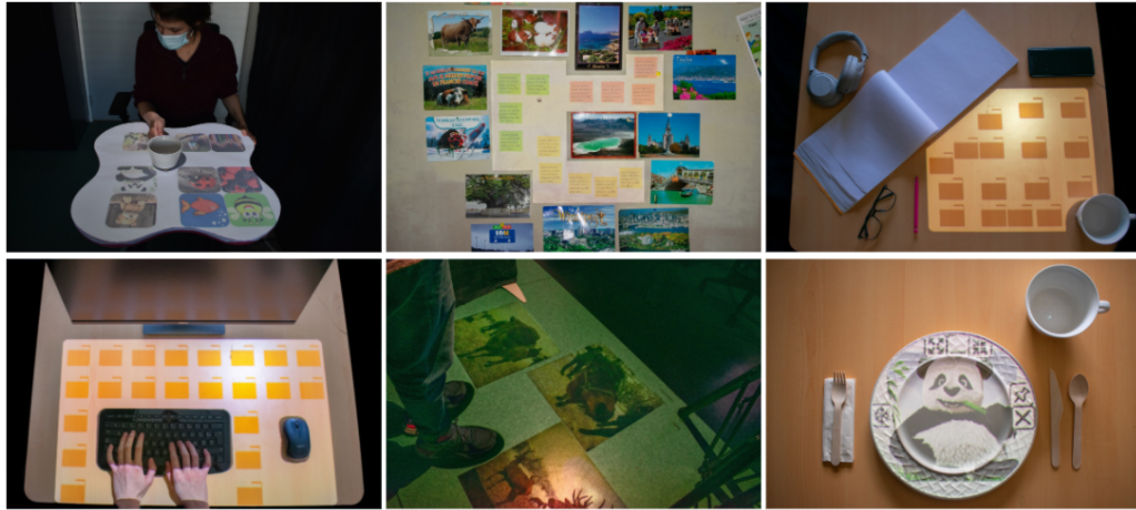
Fig. 3. Illustrative application of the Dynamic Decals

We validated our approach through an automatic evaluation that was followed and confirmed by a user study. In comparison to baselines (warping the entire interface or covering the content), the Dynamic Decals method improves interface aesthetics and content visibility while preserving content alignment and grouping.