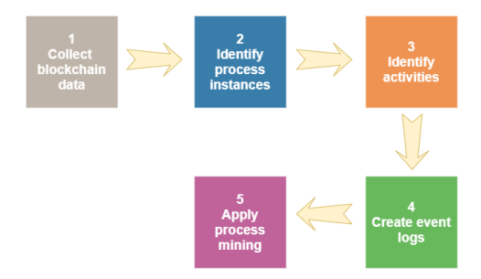
Figure 2. The steps for blockchain data preprocessing for process mining.