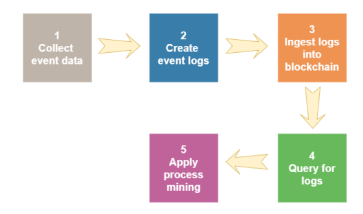
Figure 3. The steps for ingesting event data into blockchain for process mining.

of practices and tools put in place by the community behind the blockchain. Most of the approaches used Ethereum which has a very active community and several tools <sup>12</sup> <sup>13</sup> for querying it are already in place. Approaches that used Hyperledger wrote their own script for collecting the data with the help of Hyperledger dedicated clients.