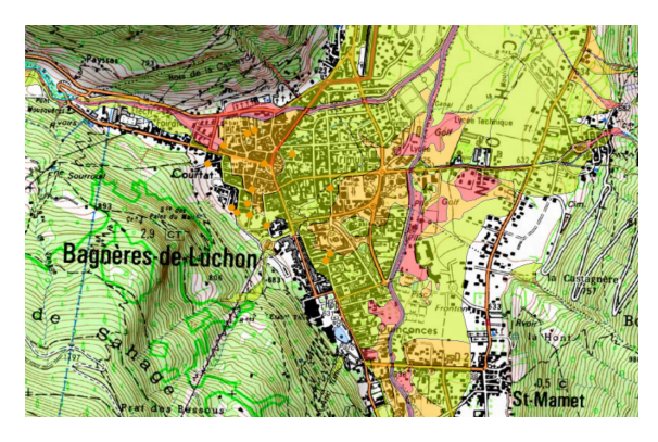
Figure 2. Map of the Area

5.3.2. Luchon's Disaster Example. The flood caused in France by the river Pique in June 2013 at Bagnères-de-Luchon, in south-western of France (mountain area in the Pyrénées) is used to evaluate the proposed approach. The map of the area <sup>13</sup> is shown in Figure 2. We can see in different colors the different hazards.