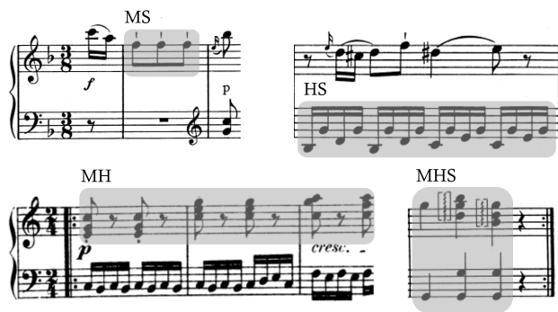
Figure 3. Example of textural layers with combined melodic M, harmonic H and static S musical functions. From Mozart K.280/189 e mm. 1-2; K.279/189 d mm. 6, K.265/300 e variation 6 mm. 1-3 and K.309/284 b , mm. 58.

ized by regularity or persistency. In Figure 2, the bass layer in bars 16 to 20 is static, since it is constituted of a single repeated note. Although this concept is rarely mentioned in the literature, it has shown to be helpful in our preliminary annotation experiments.