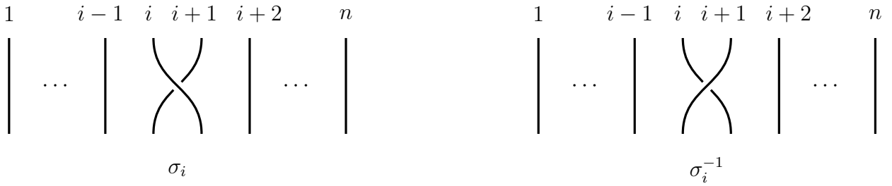
Figure 1: The braid \sigma_i and its inverse.

Geometrically, \sigma_i and its inverse correspond to the braids illustrated in Figure 1.