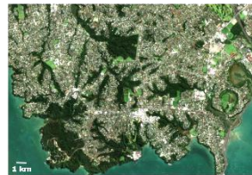
1 Old urban area