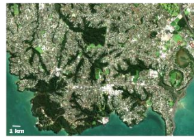
1 Old urban area