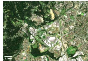
2 Recent urban area