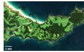
3 Rural area