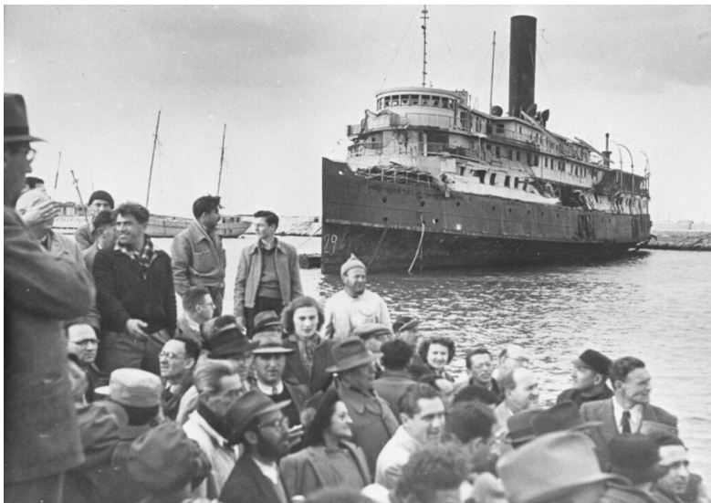
Immigration en Israël

The Lubartworld project combines a transnational history perspective with a microhistorical methodology by reconstructing the individual trajectories of each and ever Jewish inhabitant from the Polish village of Lubartów between the early 1920s and the early 1950s, whether they emigrated or stayed behind, and whether they were exterminated or survived the Holocaust.