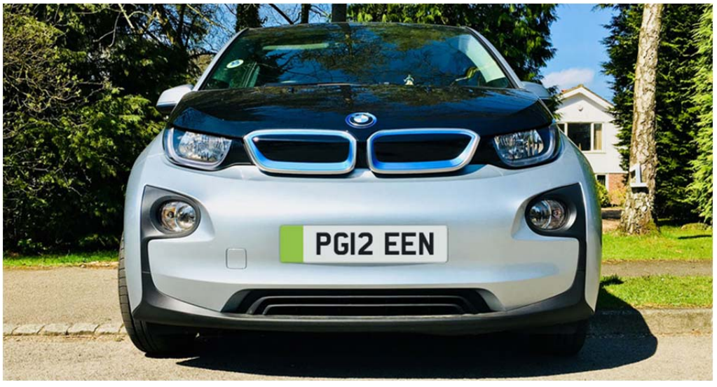
Figure 2. In the fall of 2020, the UK government implemented a green number plate policy for electric vehicles. The government argues that "the plates will make it easier for cars to be identified as zero emission vehicles, helping local authorities design and put in place new policies to incentivise people to own and drive them." This policy will also allow individuals to signal more easily their commitment to reduce their CO2 emissions and thus improve their reputation.