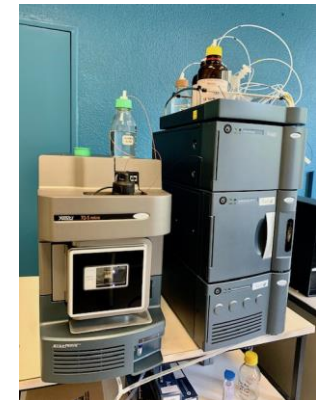
Chromatographic - mass spectrometric analysis