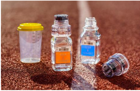
Positive urine test