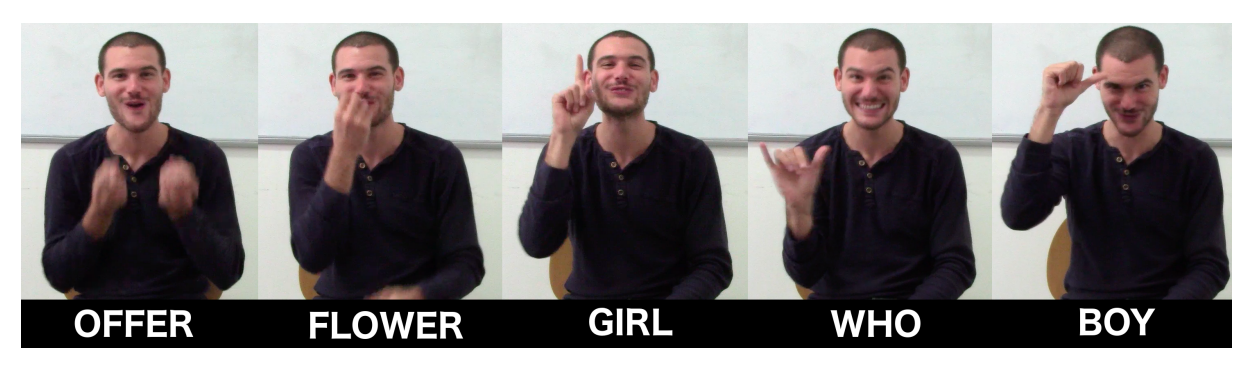
(a) 'The person whom offered flowers to the girl was the boy.'