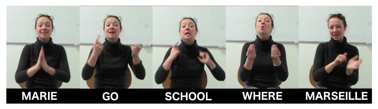
(b) 'Where Marie went to school was in Marseille.'

In order to go beyond the anecdotal observation and verify that NMMs actually distinguish questions and QAP, we conducted a preliminary study with our three informants using a discrimination task. We presented them 8 pairs of clipped QAP and questions. For QAP (4b), we cut the videos at the end of the wh-sign, before a transition movement could occur, removing the answer constituent. To avoid giving unwanted hints, we cut videos of questions making sure that the wh-signs (4a) had the same duration as in QAP. We then presented all the videos in randomized order, asking the informants to determine which were true questions. All of them performed at ceiling in the task, identifying all questions as being such. These results cannot be interpreted conclusively since more complex, controlled and representative experiments need to be conducted, but they seem to confirm the existence of two very different structures displaying distinct morpho-phonological properties.