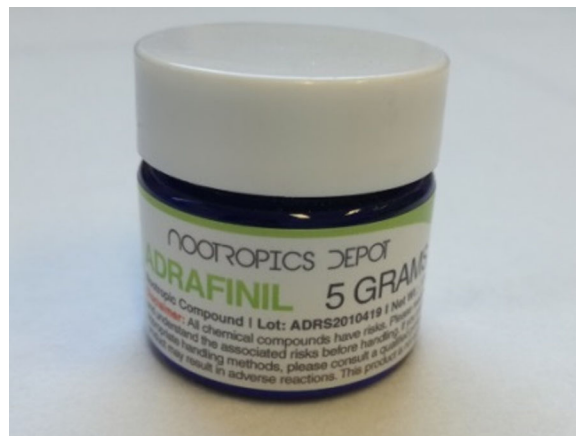
Figure 1. Adrafinil powder, bought on Internet.

Adrafinil and its metabolite, modafinil, were extracted from 20 mg decontaminated cut head hair, or cut