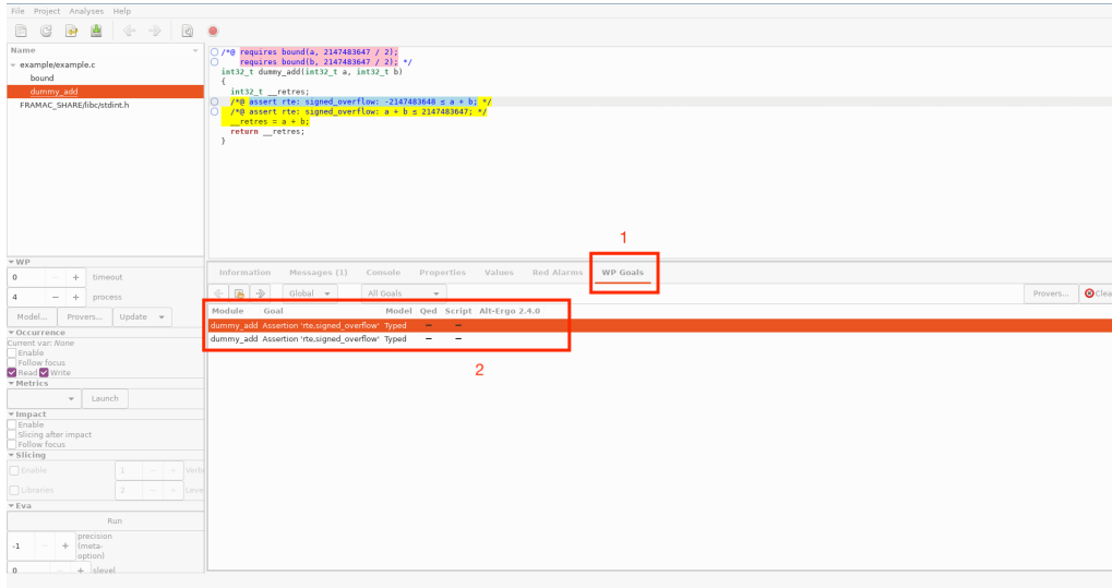
Figure 1: Select WP goals tab (1) and then chose a unproven goal (2).