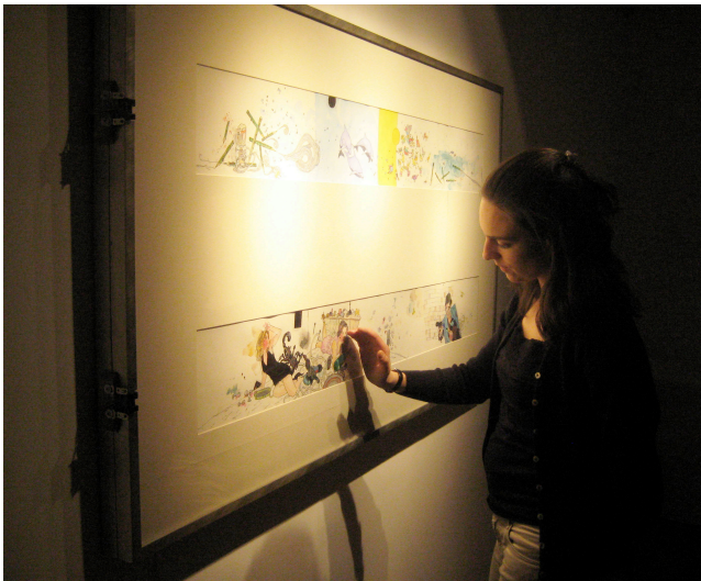
Figure 2. Imago Dixit .

I shall exclusively detail the physical interaction of the participant with the artwork, since the current configuration does not embody any behavior that flows from machine cognition. Technically speaking it is simply a matter of assigning the sensor data to sounds. However, the system should not be confused with a gestural interface and understood as such. In this sense it is not a matter of constructing an expressive instrument in order to make a convincing performance. The work is to be viewed within the context of an interactive environment, where the primary concern is to provide an additional level of engagement with the paintings as opposed to the traditional ‘look but not touch’ behavior in a gallery. The actual process of viewing a painting in an exhibition space has a long tradition in the history of western art and inevitably carries a great deal of social conventions. The installation purposely makes use of the traditional medium of the canvas enhancing the visual clues by adding an audio-haptic layer.