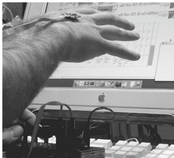
Fig. 1. Photo of prototype Sonic Swarm Controller.

The rotation of the joint of the wrist and vertical movement of the right hand, controlling the spatialisation of the sonic swarm, is mapped using Max/MSP to different parameters affecting the individual agents/sound files. The right hand outputs only 3 streams of data at any given moment coming from the 2-axis accelerometer measuring tilt attached on the wrist of the operator and the infrared sensor measuring distance on the vertical axis. The idea is that the performer is able to interact with the sonic material in a physical way by manipulating a sufficient amount of parameters but without having to control a great deal of sensors. In order though for the device to be expressive and flexible, the performer is able to dynamically assign the 3 streams of data to different parameters at the same time. In this way the same sensor can be responsible for manipulating more than one parameter at once but not necessarily in the same way by using different functions.