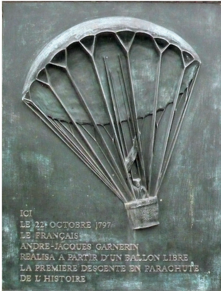
Figure 1. Bronze plaque installed in the Parc Monceau, in Paris, in 1997, at the spot where Garnerin landed.

chimney, i.e. a circular hole, at its center. Therefore, the air could only escape through the leading edges, which caused turbulence that was near fatal to the parachutist, and could have marked the end of this invention. Fortunately, Garnerin reached the ground unharmed; and the parachute, subsequently modified with the necessary improvements, obtained its long-lasting success with which we are familiar.