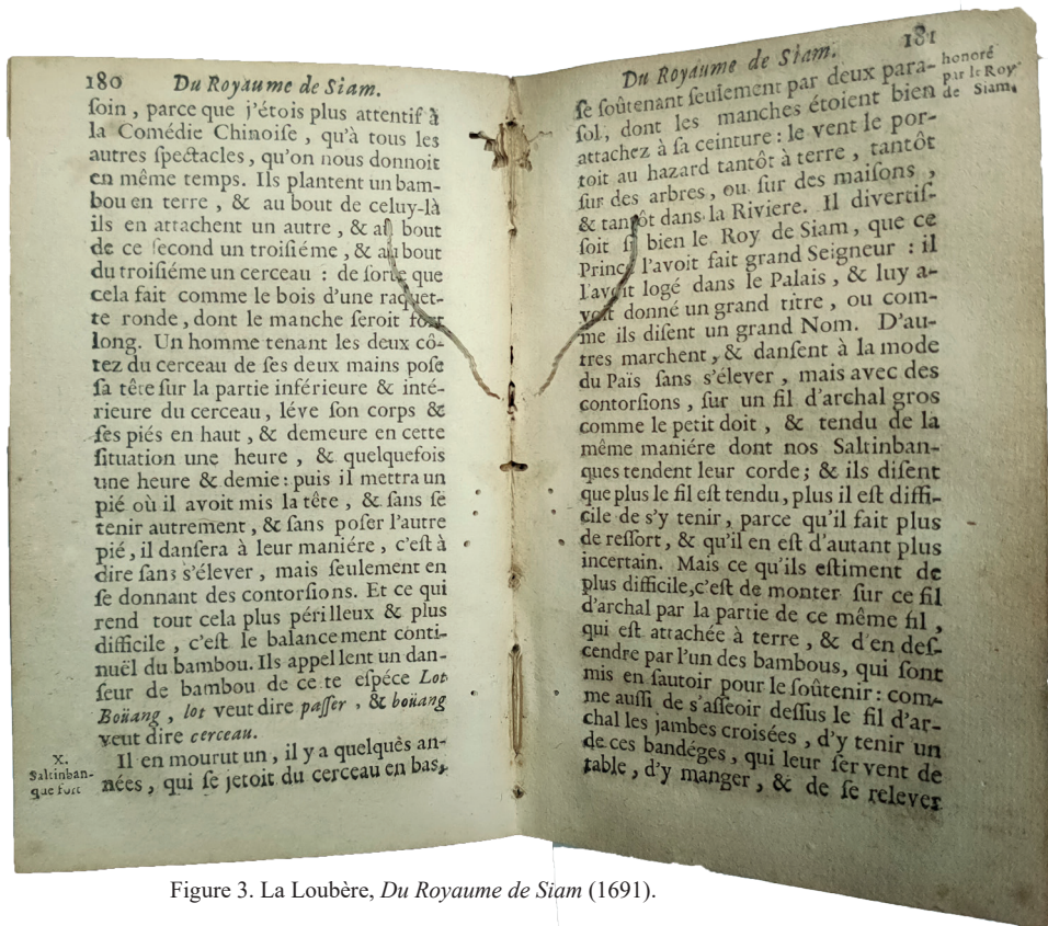
Figure 3. La Loubère, Du Royaume de Siam (1691).

on Trees or Houses, and sometimes into the River. He so exceedingly diverted the King of Siam , that this Prince had made him a great Lord: he had lodged him in the Palace, and had given him a great Title; or, as they say, a great Name. (La Loubère 1693: 47) 1