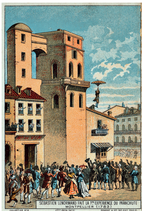
Figure 4. 19th century popular engraving of Lenormand’s supposed jump. National Library, France.

In memory of physicist Sébastien Lenormand who in 1783 from the balcony of this tower attempted the first parachute jump. 4