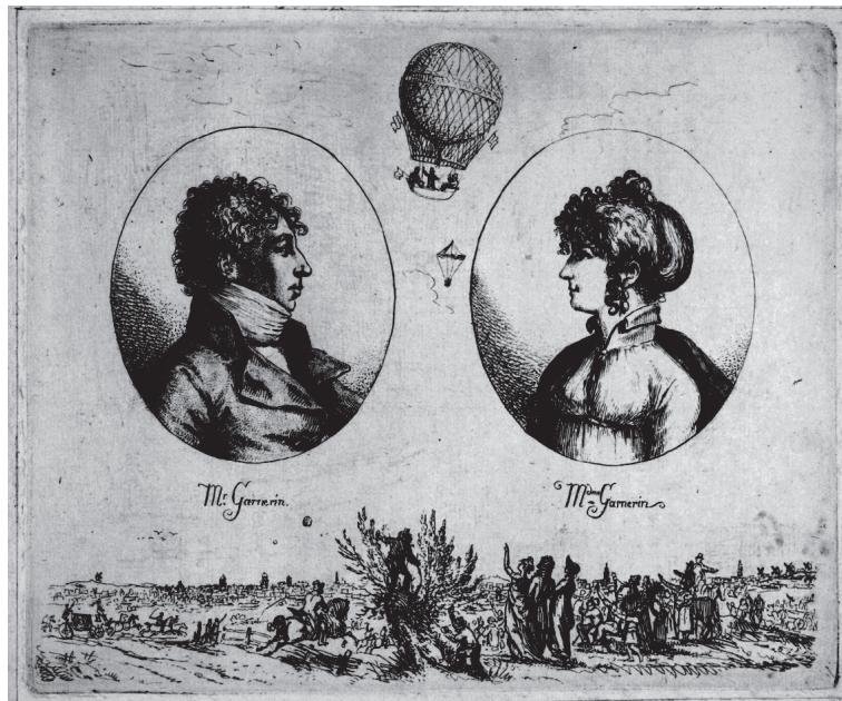
Figure 2. "Monsieur et Madame Garnerin." 19th century engraving. National Library, France.

meters, becoming history's first female parachutist. Parachuting was obviously one of the passions they shared, which led to their marriage soon after.