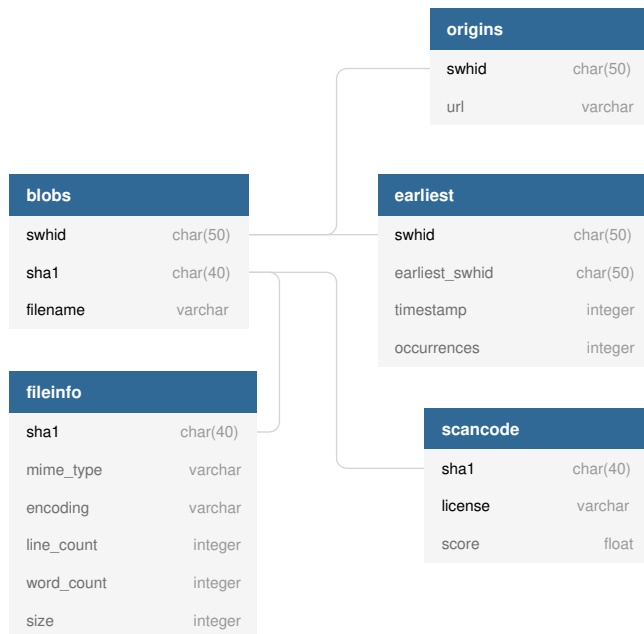
Figure 2: Relational data model for license blob metadata.

This variant of the GPL text is found with 604 different names, including "COPYING", "LICENSE.GPL3", and "a2ps.license". Note that both swhid and sha1 are used by other tables as foreign key targets and that there is no unique primary key in blobs , due to multiple filenames associated to each license file.