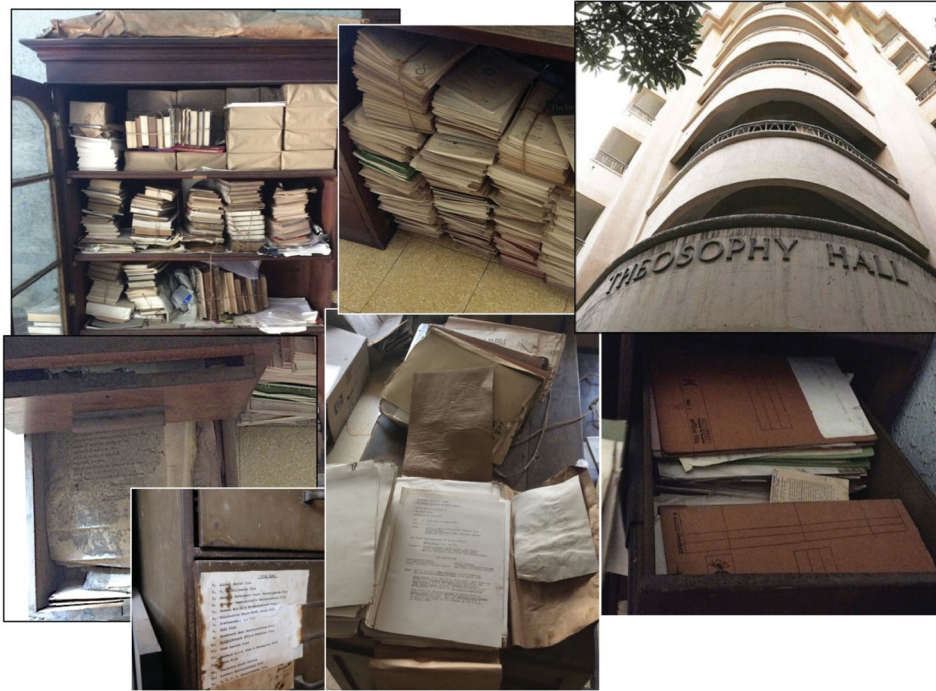
Figure 3. The Indian PEN archives.

the Theosophy Hall building in South Mumbai after the demise of Nissim Ezekiel in 2004. The material includes the whole run of the monthly, The Indian PEN , from the 1930s to the 1990s, transcripts of meetings and conferences, books, periodicals, correspondence from all over India and the world, but also more idiosyncratic documents like photos and personal postage registers.