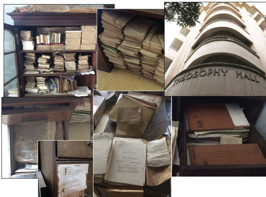
Figure 3. The Indian PEN archives.

the Theosophy Hall building in South Mumbai after the demise of Nissim Ezekiel in 2004. The material includes the whole run of the monthly, The Indian PEN , from the 1930s to the 1990s, transcripts of meetings and conferences, books, periodicals, correspondence from all over India and the world, but also more idiosyncratic documents like photos and personal postage registers.