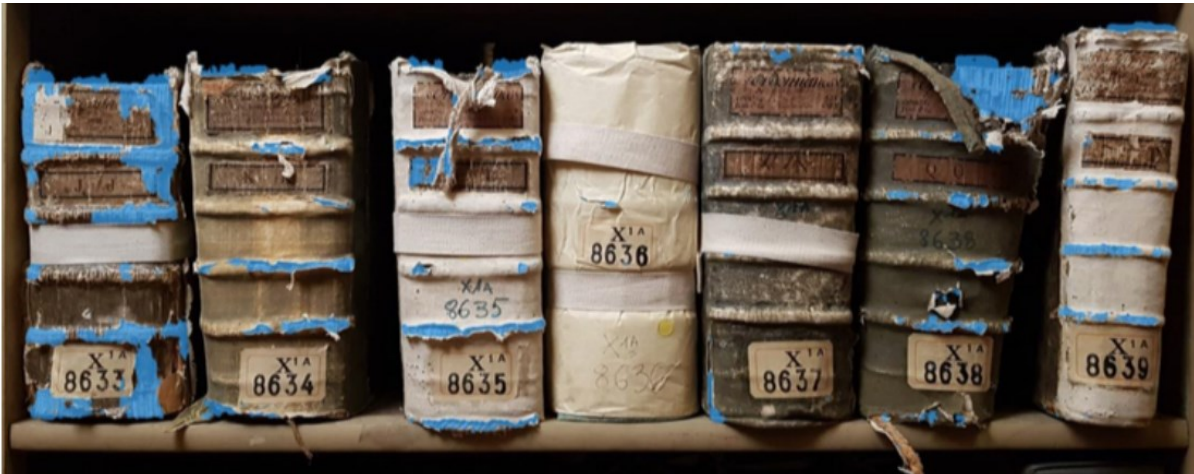
Figure 2 : Missing leather areas automatically detected with a U-Net pretrained model.

The research will continue for two more years with the Library of Quai Branly - Jacques Chirac Museum and the National Library and Archives of Quebec (BAnQ). The tool developed so far will be tested on new images of bindings dating from the end of the 19th century to the 21st century. The research will go beyond a simple implementation of existing algorithms. In the first instance, the images of the Quai Branly and BAnQ's collections are so different from those from French National Archives that a finetuning of the network will surely be necessary. Indeed, the task becomes more complex as we move from leather bindings to more recent works of various heights, thicknesses, and materials whose spines are often smooth. BAnQ's conservation team is also interested in counting and recognizing bindings that are particularly difficult to digitize. Indeed, 15,000 books will be digitized each year and BAnQ does not have enough staff members to count the number of books per shelf nor to know the number of damaged bindings that require restoration to be digitized. If the confidence score is over 95 % correct, the tool could be used every year for the collection's digitization plan.