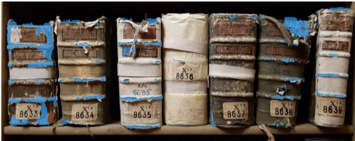
Figure 2 : Missing leather areas automatically detected with a U-Net pretrained model.

The research will continue for two more years with the Library of Quai Branly - Jacques Chirac Museum and the National Library and Archives of Quebec (BAnQ). The tool developed so far will be tested on new images of bindings dating from the end of the 19th century to the 21st century. The research will go beyond a simple implementation of existing algorithms. In the first instance, the images of the Quai Branly and BAnQ's collections are so different from those from French National Archives that a finetuning of the network will surely be necessary. Indeed, the task becomes more complex as we move from leather bindings to more recent works of various heights, thicknesses, and materials whose spines are often smooth. BAnQ's conservation team is also interested in counting and recognizing bindings that are particularly difficult to digitize. Indeed, 15,000 books will be digitized each year and BAnQ does not have enough staff members to count the number of books per shelf nor to know the number of damaged bindings that require restoration to be digitized. If the confidence score is over 95 % correct, the tool could be used every year for the collection's digitization plan.