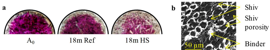
Figure 3. (a) Pictures of HC tested with phenolphthalein at A 0 , 18 months after Ref and HD ageing - (b) SEM picture of hemp concrete cross-section

More favourable conditions for fungal growth are brought by the HD ageing, where a high value of relative humidity is fixed during 70% of the time (mean RH per week = 81%). In a first step, this higher relative humidity applied than in Ref ageing impacts the carbonation of FL binder. Indeed, Figure 3.a for HC tested with phenolphthalein after 18 months in HD shows a carbonated depth higher than 2 cm. Even if more volume fraction of hemp concrete has a pH lower than 10, no fungal growth are observed, despite the high value of relative humidity applied. Then, it is the use of alternating periods of high and low relative humidity which could limit the fungal growth [15, 16]. In fact, the two days at 40% RH seem to be enough to neutralize the development of hyphae which might start during the 5 days at 98% RH. Moreover when the RH is higher than 95%, a part of the mineral binder is dissolved in the condensate liquid water in hemp concrete, which can migrate into the shiv porosity, and precipitate again during the drying step of HD [13]. This mineralization inside the shiv, observed by SEM on cross-sections of aggregate of HC sample in Figure 3-b (binder in white, cell wall in light grey and pores in dark grey), hinders the accessibility of the lignocellulosic part of hemp, and interferes with the potential fungal growth.