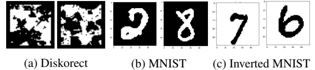
Fig. 1. Datasets example.

In order to analyze the duality of operators, we also test our network on the complementation of MNIST, which we call inverted MNIST.