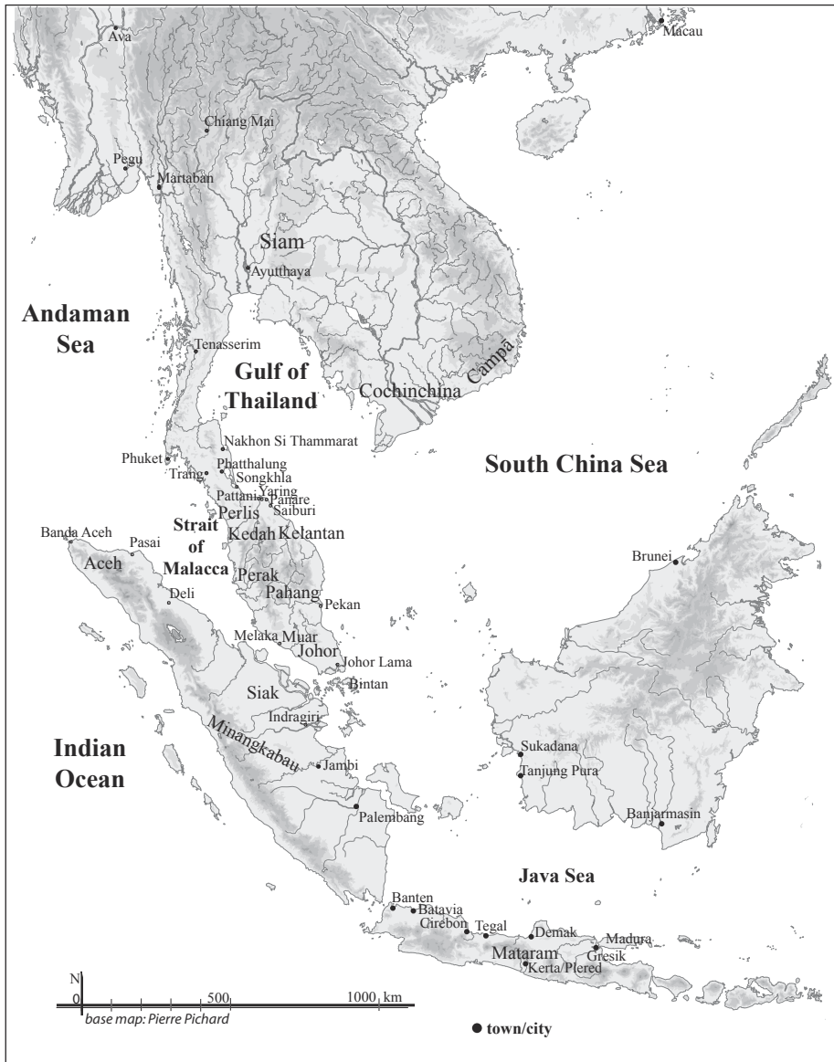
Map 1 – Main Southeast Asian place names mentioned in this volume.

called at Patani during the sixteenth century (Calanca 2001; Chin 2007). Piyada Chonlaworn's (2017) most recent study thus provides a synthesis of the various sources relating to Lin Dao-Qian.