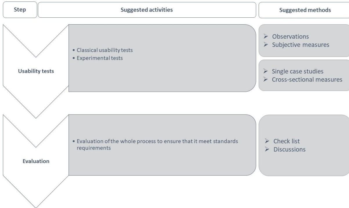
Figure 2. The third phase of our methodology is composed of two steps. The usability tests' phase proposes a solution to the classic problem of small sample size observed in usability tests by suggesting to conduct both usability tests and experimental ones. Moreover, according to Kelley and Alender (1995) experimental tests would allow to identify other types of interface design problems than the ones identified by classical usability tests. The second step (i.e., evaluation) consists of the evaluation of the process undertaken to design the DSS to ensure that it is really end-users' centered and that it meets the ISO standards requirements.