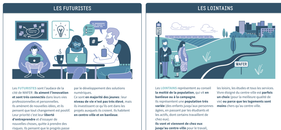
Figure 2. Extract of game cards describing two of the roles. Illustration © Marie Jamon

As shown above, the different solutions all have pros and cons, and will be more or less acceptable to different user groups. In our debate game, participants do not play in their own name, but will assume a role as member of a specific group of citizens. The idea of having users play a role other than themselves is not new and is proven to favour perspective-taking (Jarvis et al. 2002; Resnick and Wilensky 1998). We also wanted participants to take distance from their character to keep the debate more peaceful, all the more on a very sensitive topic while the COVID-19 epidemic is still not over.