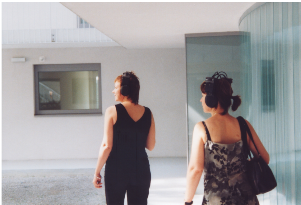
Fig. 2: Peter Ablinger, Weiss/Weisslich 36, headphones , 1999. Version 2004, Hängende Gärten , Wienerberg, Wien Modern, Juli-August 2004.

through mobile devices. The piece consists of microphones connected to headphones that directly amplify the auditory situation that the listener is in. Therefore, Weiss/Weisslich 36 creates a short-circuit by using the headphones with the same function as that of Max Neuhaus's stamp in his Listen series: inviting us to switch from hearing to listening . As the artist declared, "What you hear with headphones is the same as without. But: the same is not the same. There is a difference. At least the difference between just being here and: listening. That difference is the piece" (Ablinger 2008, 71).