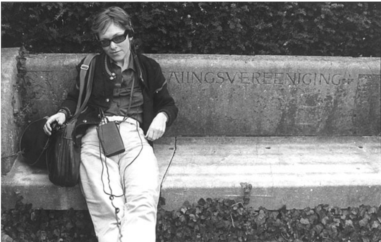
Fig. 4: Willem de Ridder, The Walk , 1981, one of the participants.

By 1981 – that is, just two years after the launch of the Walkman into the market – these potentialities were already being exploited by the Dutch Fluxus artist Willem de Ridder. His project The Walk comprised a series of audiotapes and a booklet sold at De Appel Foundation in Amsterdam, that would lead the listener to wander the entire country following the artist’s instructions recorded on a soundtrack that overlaid music, voice and story telling.