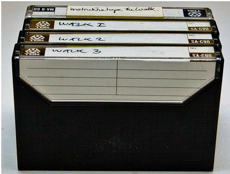
Fig. 5: Willem de Ridder, The Walk , 1981, audiocassettes from the collection of de Appel arts centre.

Interestingly, De Ridder connects this work to the performing arts and, in particular, to his “Audio Directed Theatre Events” – projects that, through audio recordings or radio transmissions, invited the public to stage actions, micro-performances or to explore the space in random ways on foot, by car or on public transport.