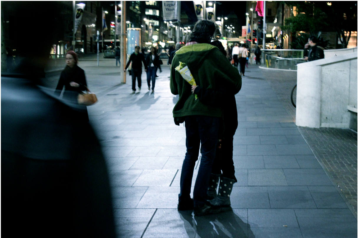
Fig. 7: Circumstance, As If It Were The Last Time , subtle mob.

Others artists are working on less individual cinematic processes by creating collective performances and flash mob formats, an example being Circumstance – a group of artists who, for several years, have been developing “subtle mobs,” urban performances enacted by groups of strangers transformed into participants and lead by a downloadable audio track.