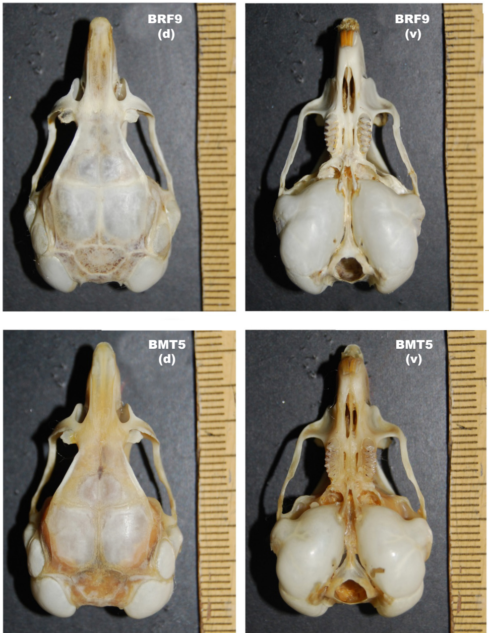
Fig. 3. Skulls of the individuals BRF9 and BMT5 on the dorsal (d) and ventral side (v).