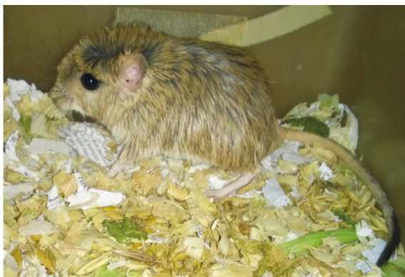
Fig. 2. Young adult male of Meriones crassus (BRF9).

Fig. 2. Ejemplar de macho adulto joven de Meriones crassus capturado (BRF9).