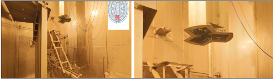
Fig. 4 Left: view of the fuel-loading machine before the trainer zooms in on it. Right: view as the trainer gives an explanation

and to their professional culture. Because the trainees were able to both hear and see, they became even more active in their own learning.