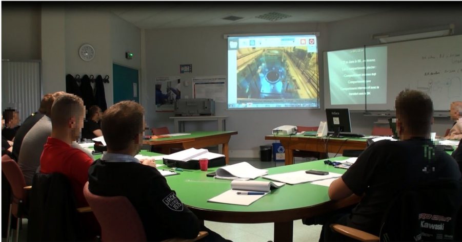
Fig. 2 Photo of the training session

systems, reactor coolant systems, coolant pumps, steam generators, pressurizer, outage status, etc.). The teaching objectives according to the training's requirements of this course were: i) to give details about the locking/unlocking procedure of the reactor building, and ii) to characterise the primary system and the containment system. The twelve field operators participating in the training had all been recently hired to work in the nuclear plant, and some of them had other experiences in the company (e.g. coal-thermal plant, hydroelectric plant).