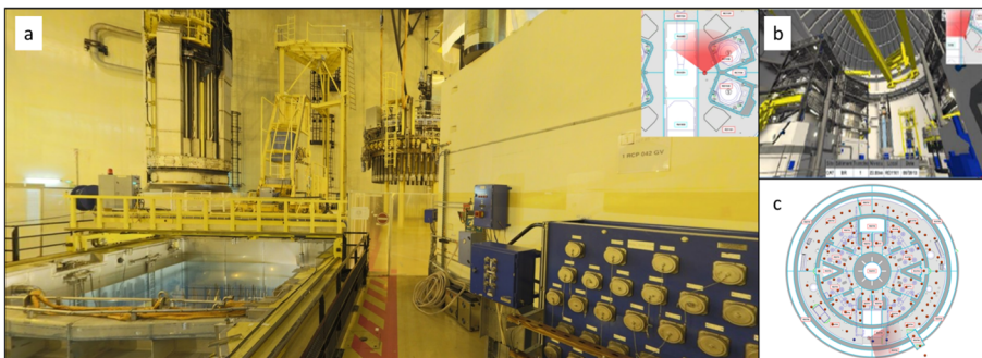
Fig. 1 Three display modes offered by VVProPrepa: (a) spherical photo with on top right a "radar", a small 2D plan in miniature inlay to orient oneself in relation to the view of the spherical photos; (b) 3D reconstruction; (c) 2D plan

The teaching activity of the two trainers took place during a traditional and theory-driven classroom training session (Fig. 2) led with the support of the virtual environment displayed on a whiteboard. The session had a duration of two hours. The session's topic was the reactor building's setup (reactor vessel/pressure channels, containment