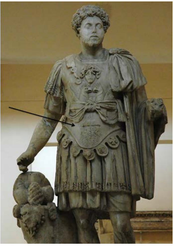
Fig. 7. A statue of Marcus Aurelius with the breastplate engraved with a cross.

les, or the Hera Samia by Lysippus and Boupalos). This phenomenon also finds its counterpart in the field of literature with, for example, the Ekphrasis , in verse, by Christodorus of Coptos ( AP II). Writing under the reign of Anastasius, the poet described the statues which decorated the baths of Zeuxippus in Constantinople, where Constantine and his successors had established a large gallery of ancient statues collected across Greece, Asia and Italy: the great deities of the Greek pantheon (Apollo, Aphrodite, Artemis, Poseidon, etc.) were accompanied by legendary heroes (above all the characters of the Iliad and the Odyssey ), historical heroes (Caesar, Pompey, etc.), and the great authors of literature (Homer, Menander, Thucydides, etc.).