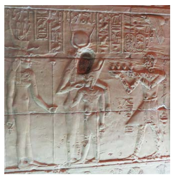
Fig. 3. Isis with her head intentionaly mutilated in the temple of Philae.

Mark the Deacon, in his Life of Porphyry , also left us one of the most striking tales of temple destruction, that of the Marneion in Gaza. The task was only accomplished thanks to a prescription revealed by God to a child ('Burn [the temple] in the following way: bring liquid pitch, sulfur and pork fat, mix the three things, coat the bronze doors with it, set them on fire, and so the whole temple will burn: because otherwise, it is not possible').<sup>39</sup> And yet, in spite of this divine counsel, the fire, with the collapse of a burning beam, did not fail to take a victim and it took several days for the temple to burn down completely. Under such conditions, the destruction was often partial or symbolic. Christians were satisfied just to remove and break the statues (idols, inhabited by demons),<sup>40</sup> to paint over the frescoes<sup>41</sup> or to smash the bas-reliefs, as amply testified by examples in Egypt, especially in Philae.<sup>42</sup> (Figs. 2 and 3).