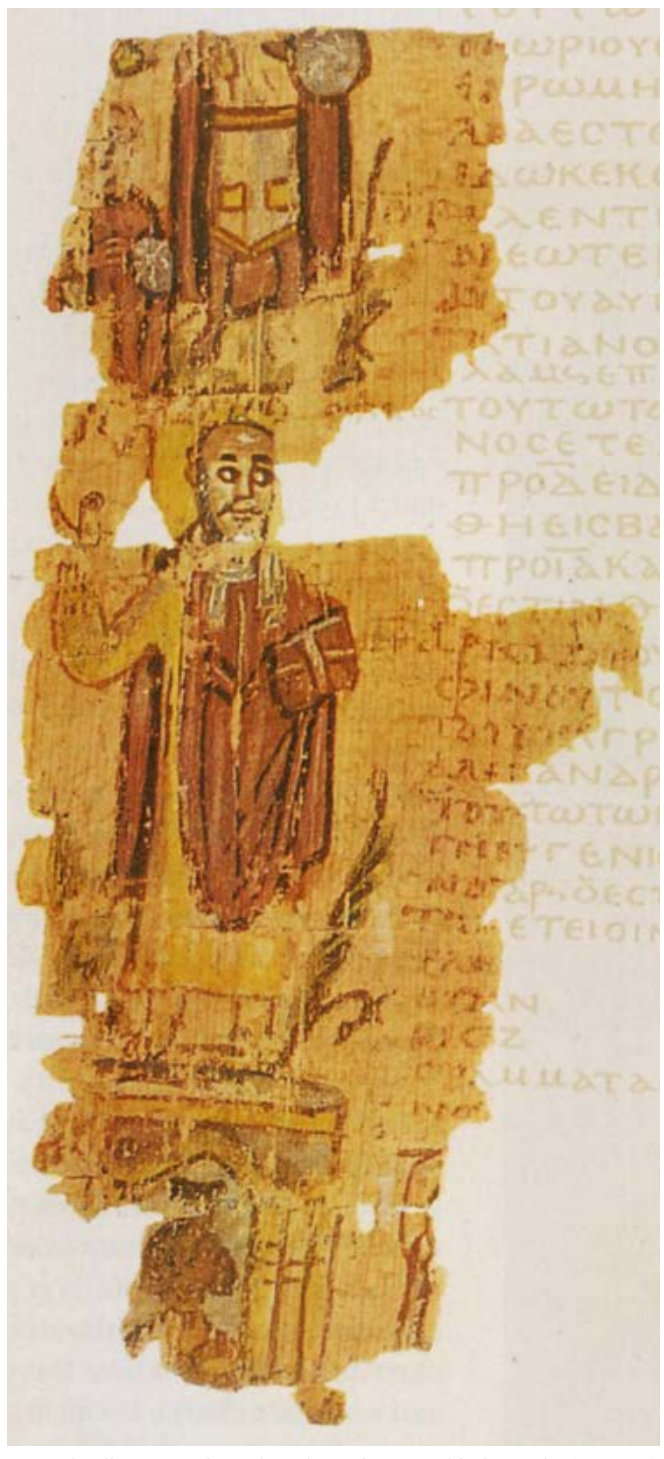
Fig. 1. The illustration from the "Alexandrian World Chronicle" (AD V-VI) representing Theophilus trampling the Serapeum, Moscow, Pushkin Museum, Inv. 310/8, verso. (Image from BAUER - STRZYGOWSKI 1905, pl. VI verso).

The destruction of the temple of Kothos is, from this point of view, a textbook example: the eponymous deity of the temple is unknown to us; its destruction was miraculous; and finally, this episode was followed by a conclusion which reveals the genuine meaning of the story: after the temple has been burnt, Macarius, on his way back, met the high priest of this temple. He had the pagan priest arrested and thrown into a fire, where he 'was burned together with the idols that had been found in his house'. This high priest was called Homer ("Ομηρος), a personal name which was rarely used at that time. This shows us that, behind the fire