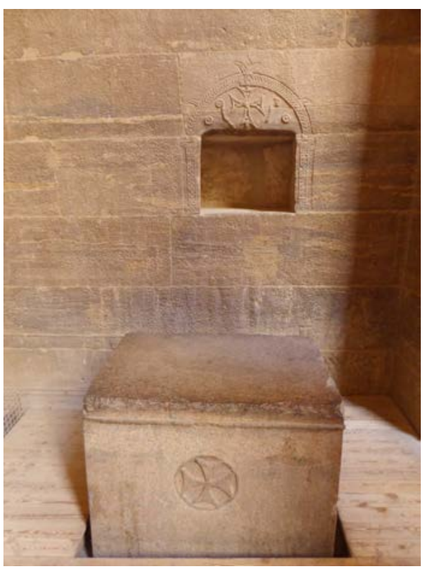
Fig. 5. The altar and niche of Saint Stephen's oratory in the pronaos of the temple of Philae.

As we have seen, the few examples which are not suspect do not attest to direct or linear conversions, which would forcefully confirm the victory of Christianity over paganism by materialising, in a sense, the famous formula Ο Σταῦρος ἐνίκησεν 'the Cross has won'. Indirect transformations took place after the premises had been abandoned for a certain period. Christian authors, then, took advantage of the conversions to speak of the symbolic value of the events. The majority of the examples belong to a later period (after the middle of the fifth century and especially from the sixth century).74 In most cases, this break in continuity is accompanied by a partial dismantling of the old place of worship and/or a spatial dissociation (often downplayed in literary sources): the church or monastery was built in another place or in an outlying part of the sanctuary – at least not in the naos , which was totally unsuitable -75with materials (spolia) from the temples.76 There are many examples of these re-uses.77