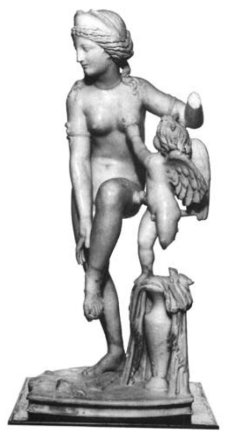
Fig. 6. The statue of Aphrodite and Eros from the villa of Sidi Bishr.