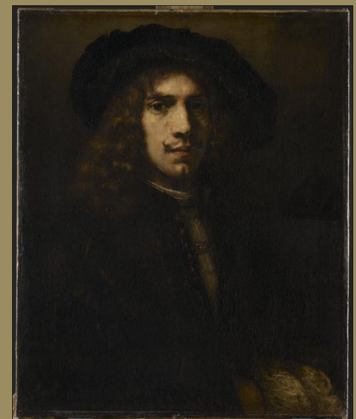
Follower/ studio of Rembrandt Portrait of a Young Man or Titus , ca. 1658, oil on canvas, 75 x 60,5 cm, Paris, musée du Louvre, INV.1749

December 1936 : Legitimacy of removing the varnish.