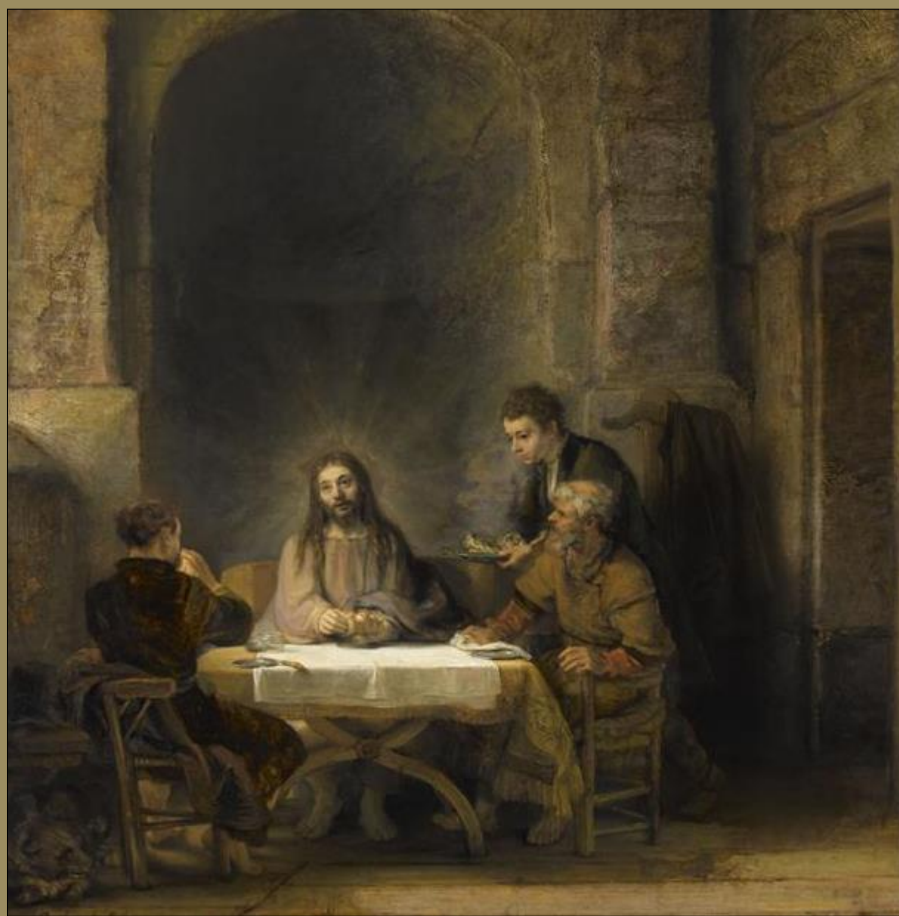
Rembrandt van Rijn, The supper at Emmaus, 1648, oil on panel, 67,8 x 65 cm, Paris, musée du Louvre, INV.1739