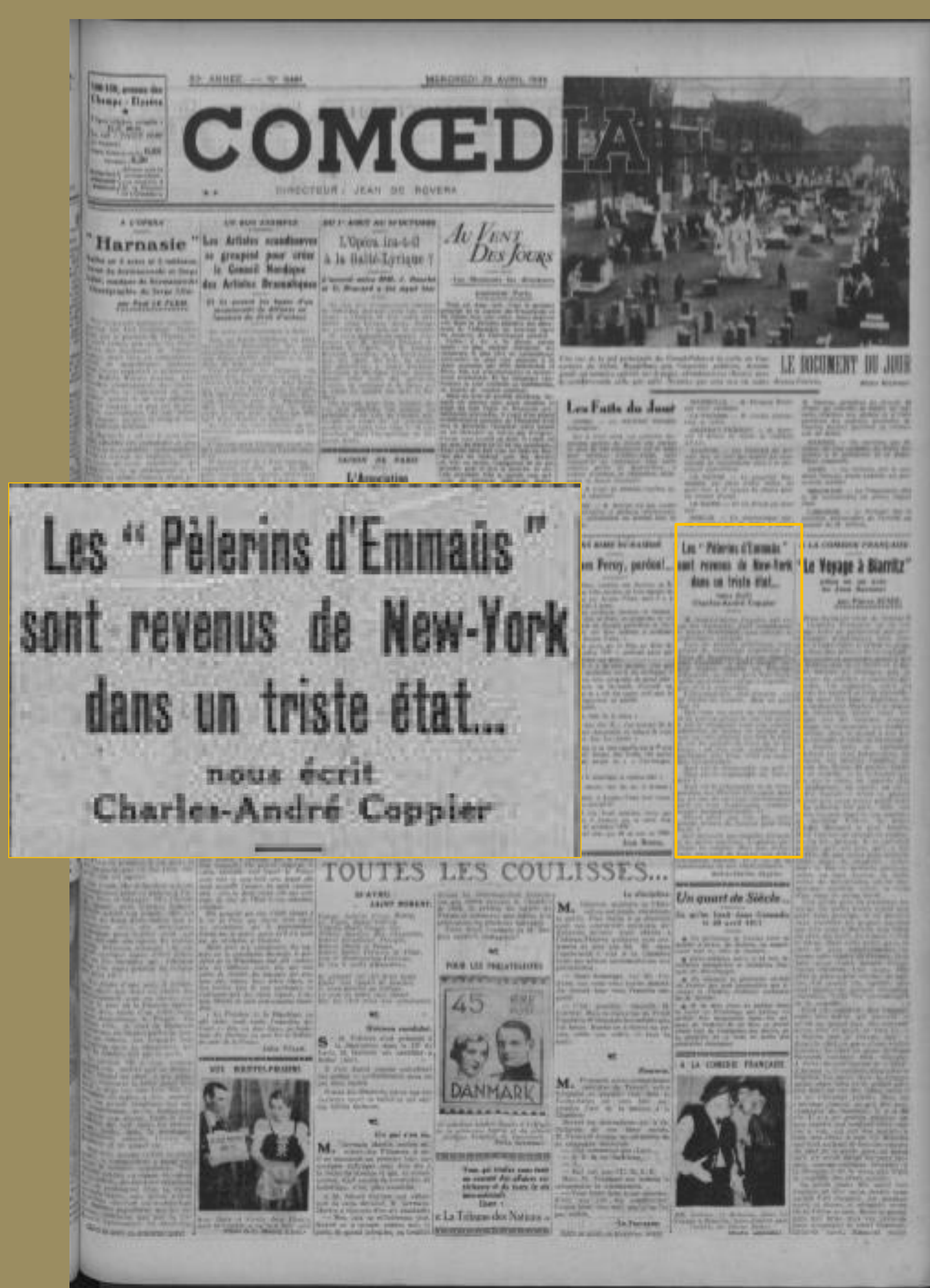
Coppier, Coemedia , 30th of April 1936

Les Eaux-fortes authentiques de Rembrandt , Paris, 1929.