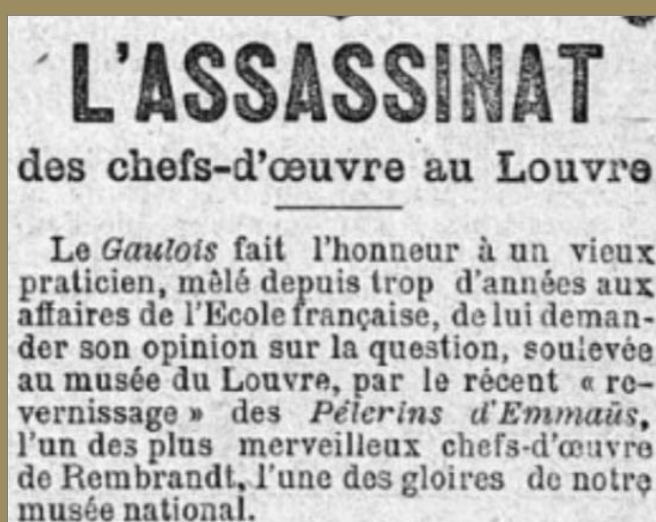
G. Clemenceau, La Justice , 6th of June 1894

After this case, the Luxembourg museum's Conservator suggested that museum's attendants should be trained for easy painting maintenance.