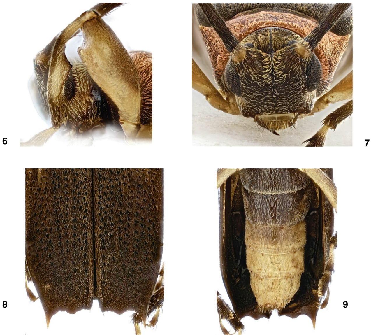
Fig. 6–9. Pseudosparna mantis sp. nov., holotype ♂. 6) Profemur and protibia, lateral view. 7) Head, frontal view. 8) Elytral apex. 9) Abdominal ventrites.

ventrites, shape of last abdominal ventrite, and shape of profemora and protibiae. Mermudes & Monné (2009) included Pseudosparna in the Tribe Acanthocinini, while Miguellus is in the tribe Colobotheini. The frontal shape of the head of Pseudosparna mantis sp. nov. is much more similar to that of the species of Acanthocinini than in species of Colobotheini. However, at least some species of Pseudosparna have the frons exactly as in many species of Colobotheini (including Sparna Thomson, 1864). Furthermore, species of Pseudosparna have erect setae on elytra (throughout or only on margins), while they are absent in Miguellus . A careful study of the species of Pseudosparna is necessary to establish the proper tribal placement of the genus, as well as determining whether or not it is monophyletic.