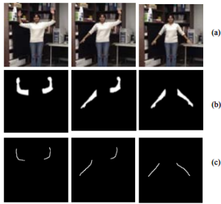
Sample images showing (a) original data, (b) binary image data and (c) results of the medial skeletonization operation.