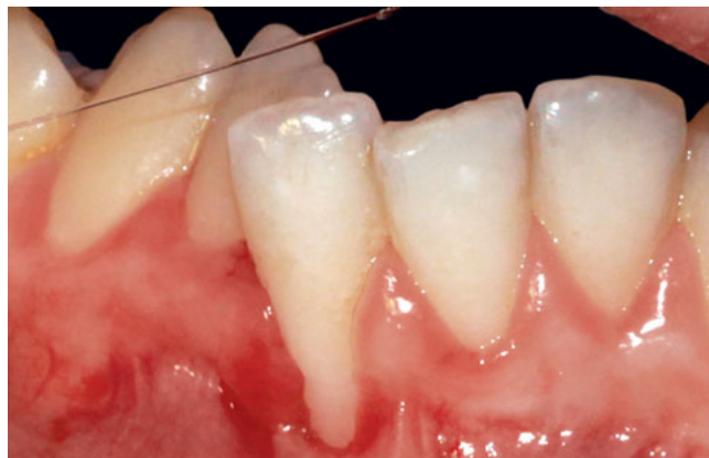
Fig 1 Marginal tissue recession due to bacterial inflammation and tooth malposition.

However, probing may be challenging in children. More convenient tests may be advantageous to identify the patients and teeth at risk of gingival recession, which is always difficult to treat in children. A whitening of the attached gingiva with coronal labial traction could be related to its low resistance under tension. The visibility of capillaries located in the chorion could also reasonably suggest a thin gingiva.