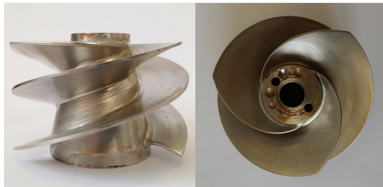
Figure 2: Different views of the inducer U1