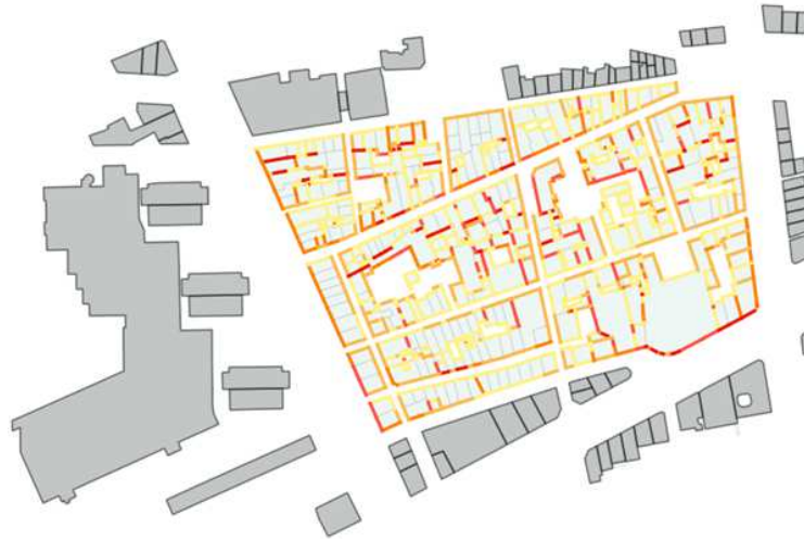
Figure 3. Example of global solar irradiations received by each elevation [Wh/m 2 ] of building. Calculations carried out by take into account urban obstructions.

Result of solar energy received by the building is integrated in the heat balance calculations proportionally to the opening ratio of each elevation and window solar factor. Finally, the energy heat balance is performed on the basis on heat losses, solar gains and normalised internal gains.