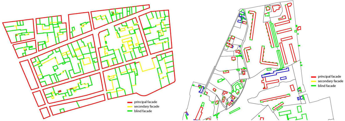
Figure 2. Example of elevations classification in a dense urban context and in a suburban context.

At this treatment stage, an elevation has attributes (area, orientation, classification) and are referenced by an identifier number that qualifies its assignation to a building.