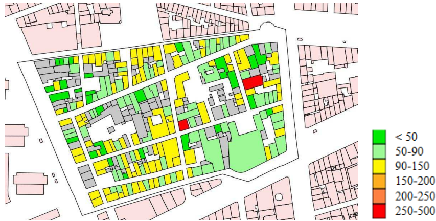
Figure 4. Example of heat balance areas obtained.