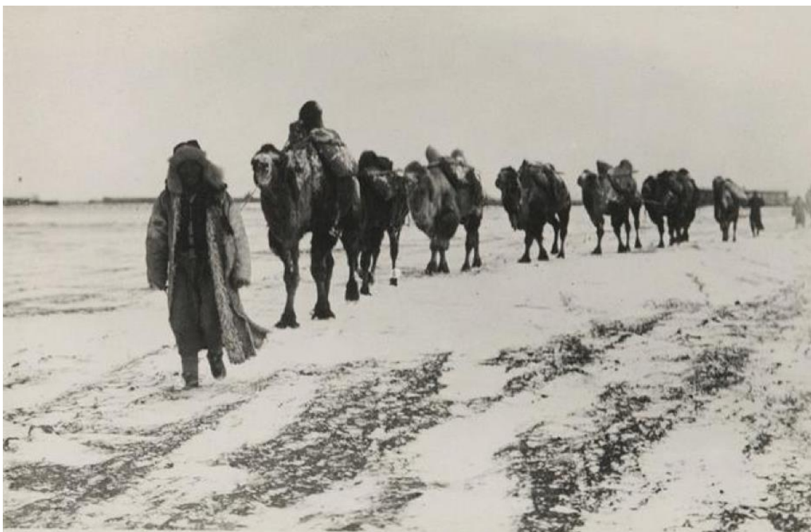
figure 1: A camel caravan in Inner Mongolia, early 20th century.

Keywords: Human Mobility, Network, Security, Migration, Caravan Knowledge, China