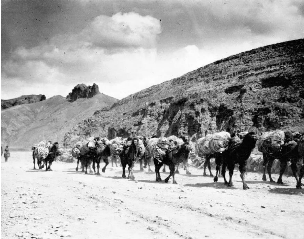
figure 4 : A caravan of goods on camels between Shanxi and Hebei provinces.

The Shanxi caravans (also those of Hebei and Shandong) were thus unique in that they were composed of professional escorts ( biaohang 鏢行). That is to say, specialists mastering, among other things, human power transportation techniques (driving handcarts), brigands' jargon and local languages (such as 'dark language', heihua 黑話), as well as martial arts techniques and the use of the rifle. Both the escorts and their companies belonged to family or clan lineages of martial arts schools, and recruitment into a company was done internally and according to the rules of the particular lineage. The members of an escort company had a different status depending on their seniority and skills, and on the knowledge they possessed by natural disposition or transmission. For example, there are those who are recruited for their knowledge of the environment and ways of communicating with different local groups, or for their mastery of a particular skill (healer, craftsman). There are also those who are recruited for their good eyesight, others for their keen hearing, and still others for their olfactory sensitivity - being able to recognise which animal a particular smell belongs to (via faeces) in order to detect the possible presence of brigands, who usually travel with horses.