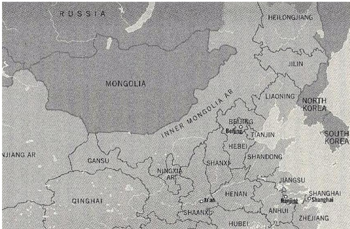
figure 3: Current Northern China Provinces.