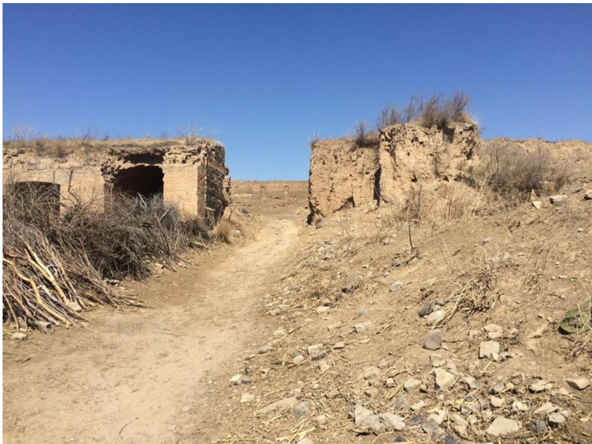
figure 7: An ancient route in Shahukou 杀虎口, Shanxi/Inner Mongolia “border”.

The studies carried out on Chinese human mobility across the land in the North (see figs. 2 and 3) prior to the 20th century indicate that caravaneers could not do without individuals who mastered local knowledge and the most elementary techniques of daily life. They highlight the relevance of investigating a hitherto little-investigated everyday life, whose apparent “banality” reveals situations that are rich in information about know-how (knowing how to repair and make shoes, for example) and social functioning.