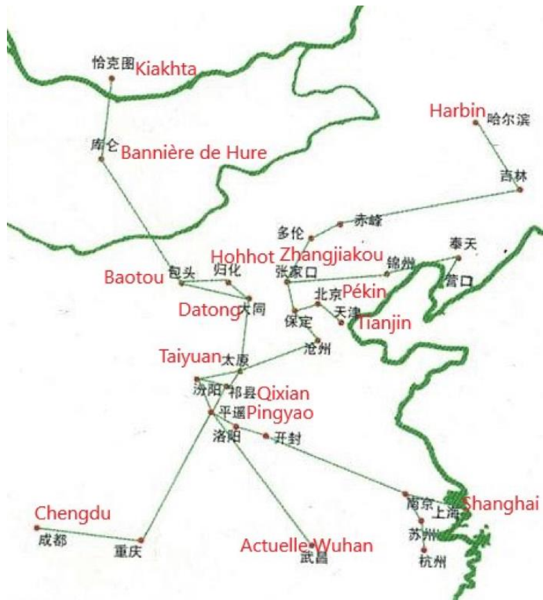
figure 5: Routes recognised and taken by escort companies during the Qing period.