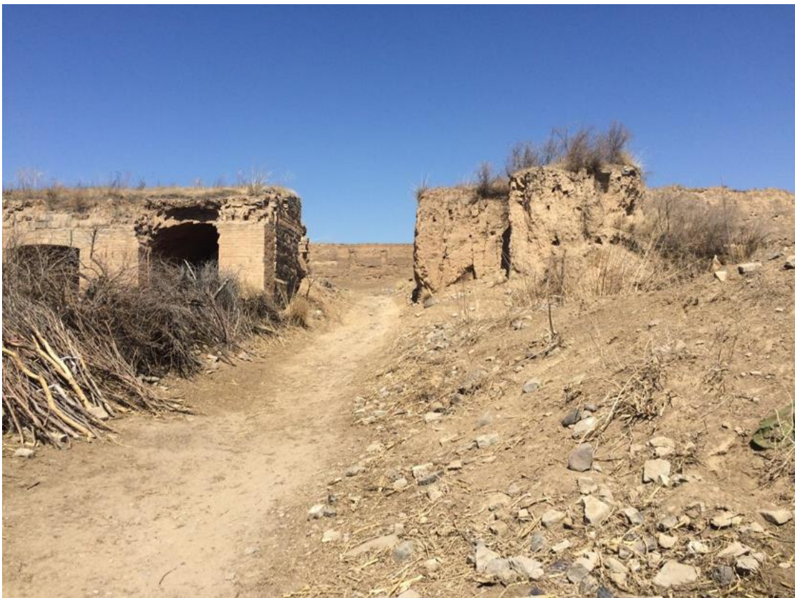
figure 7: An ancient route in Shahukou 杀虎口, Shanxi/Inner Mongolia “border”.

The studies carried out on Chinese human mobility across the land in the North (see figs. 2 and 3) prior to the 20th century indicate that caravaneers could not do without individuals who mastered local knowledge and the most elementary techniques of daily life. They highlight the relevance of investigating a hitherto little-investigated everyday life, whose apparent “banality” reveals situations that are rich in information about know-how (knowing how to repair and make shoes, for example) and social functioning.