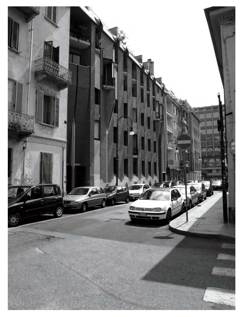
Figure 5.1 Roberto Gabetti and Aimaro Isola, Bottega d'Erasmo, Turin, 1953–7