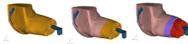
Figure 1. The three different meshes.

The medical images were manually segmented with 3D slicer 4.4.0 (Fedorov et al. 2012) to reconstruct: