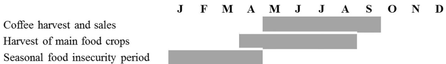
Fig. 1 Calendar of agricultural activities and seasonal food insecurity

diversifying its activities to include other products, for example, sugar cane. The third PO in the area was created in 2006 with the support of an export company, PRONATUR. It received certification for organic coffee in 2006.