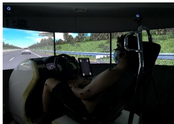
Figure 1. Experimental setup.

The driving simulator (Figure 1) was composed of a steering wheel, three pedals, three mirrors, a control panel as well as 5 screens positioned in a semicircle. The vehicle automation was simulated by the V-HCD software environment (Bellet et al. 2019). Electromyography (EMG) electrodes were placed on the deltoid and brachioradialis muscles of the right arm to detect the onset of steering wheel reaching and the rectus femoris and