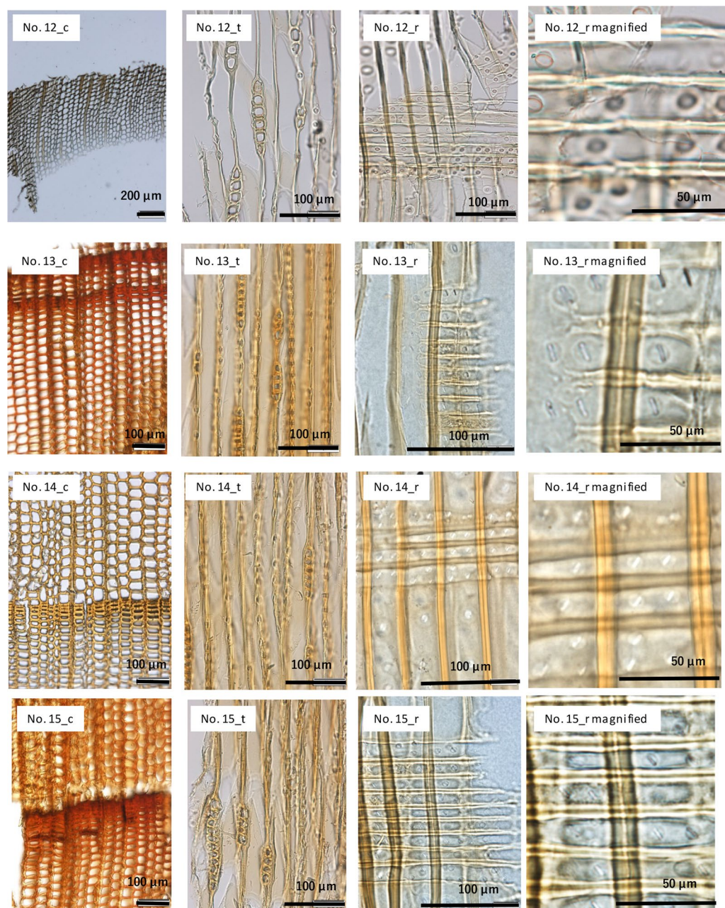
Fig. 2 continued

the Heian period, T. nucifera tends to be used more in single-block sculptures. From this perspective, the fact that most of the Japanese Buddhist statues we surveyed in the Museum of Fine Arts, Boston, were made of Ch. obtusa is an important finding when considering their age.