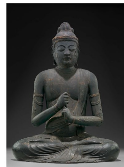
No. 13-15, 11.11428: Dainichi, the Buddha of Infinite Illumination Japanese, late Heian period, dated 1105 (Chōji 2) • William Sturgis Bigelow Collection