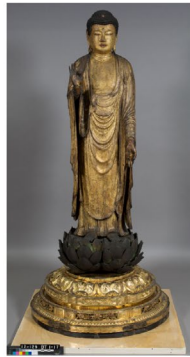
No. 1, 12.129.1-2 : Amida, the Buddha of Infinite Light Japanese, Kamakura period, latter half of the 13th century • Special Chinese and Japanese Fund