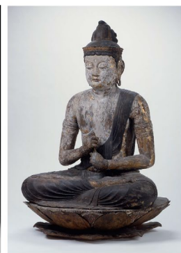
No. 6, 7, 11.10.1-2 : Dainichi, the Buddha of Infinite Illumination Japanese, late Heian period, latter half of the 11th century • Denman Waldo Ross Collection