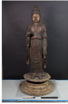
No. 2, 12.333 : Deva, a Heavenly Being Japanese, late Heian period, first half of the 11th century • Gift of Francis Gardner Curtis