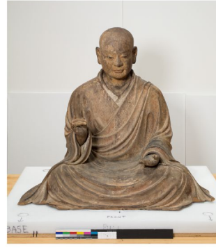
No. 3, 36.413 : The Shinto Deity Hachiman in the Guise of a Buddhist Monk Japanese, Kamakura period, dated 1328 • Maria Antoinette Evans Fund and Contributions