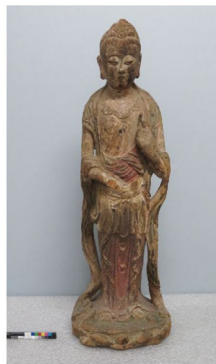
No. 4, 50.1948 : Figure of Guanyin Chinese, Song dynasty, 960–1279 • Bequest of Charles Bain Hoyt—Charles Bain Hoyt Collection