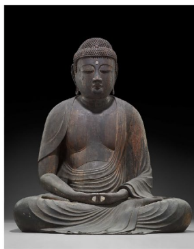
No. 5, 09.73 : Amida, the Buddha of Infinite Light Japanese, late Heian period, 12th century • Denman Waldo Ross Collection