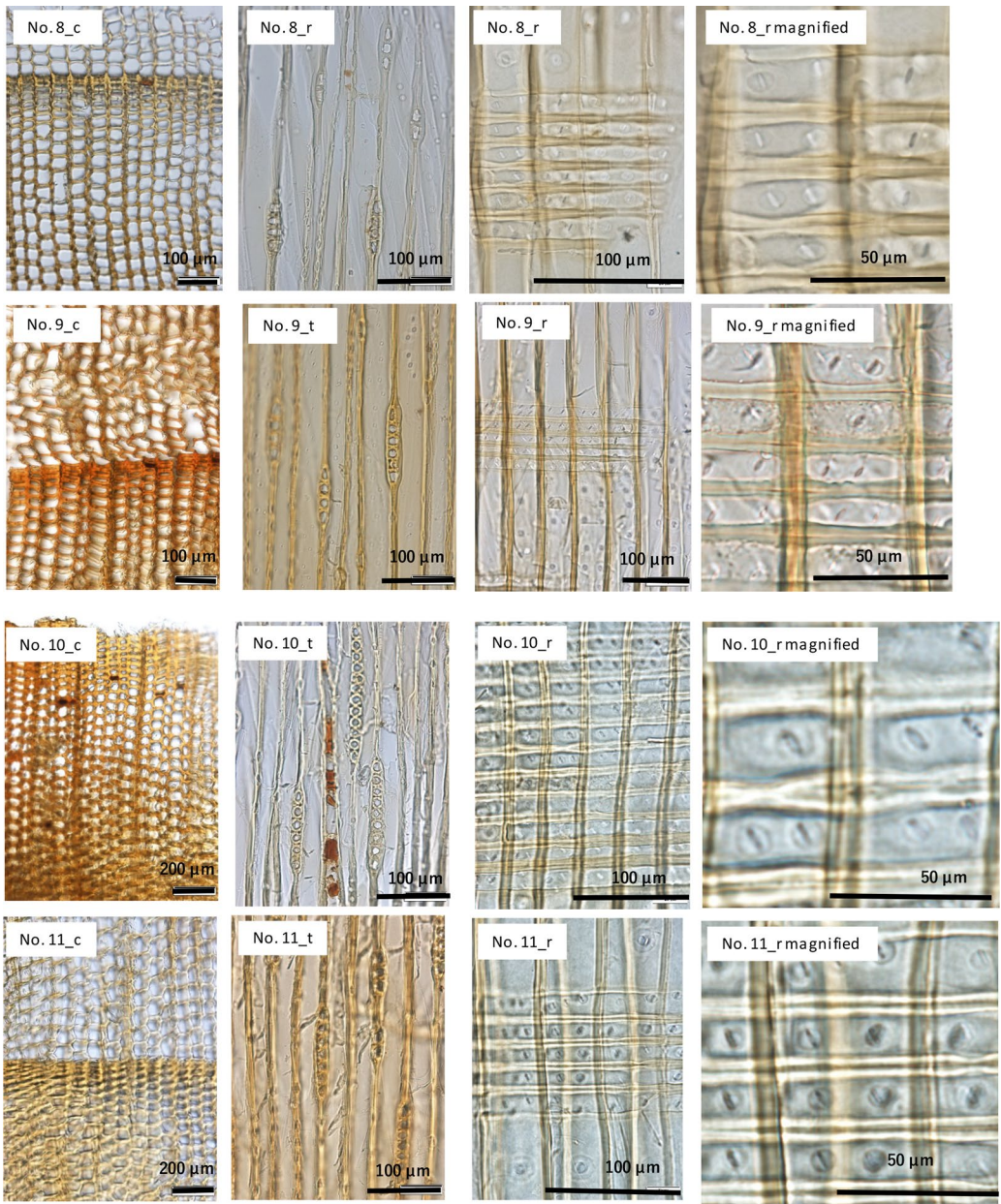
Fig. 2 continued