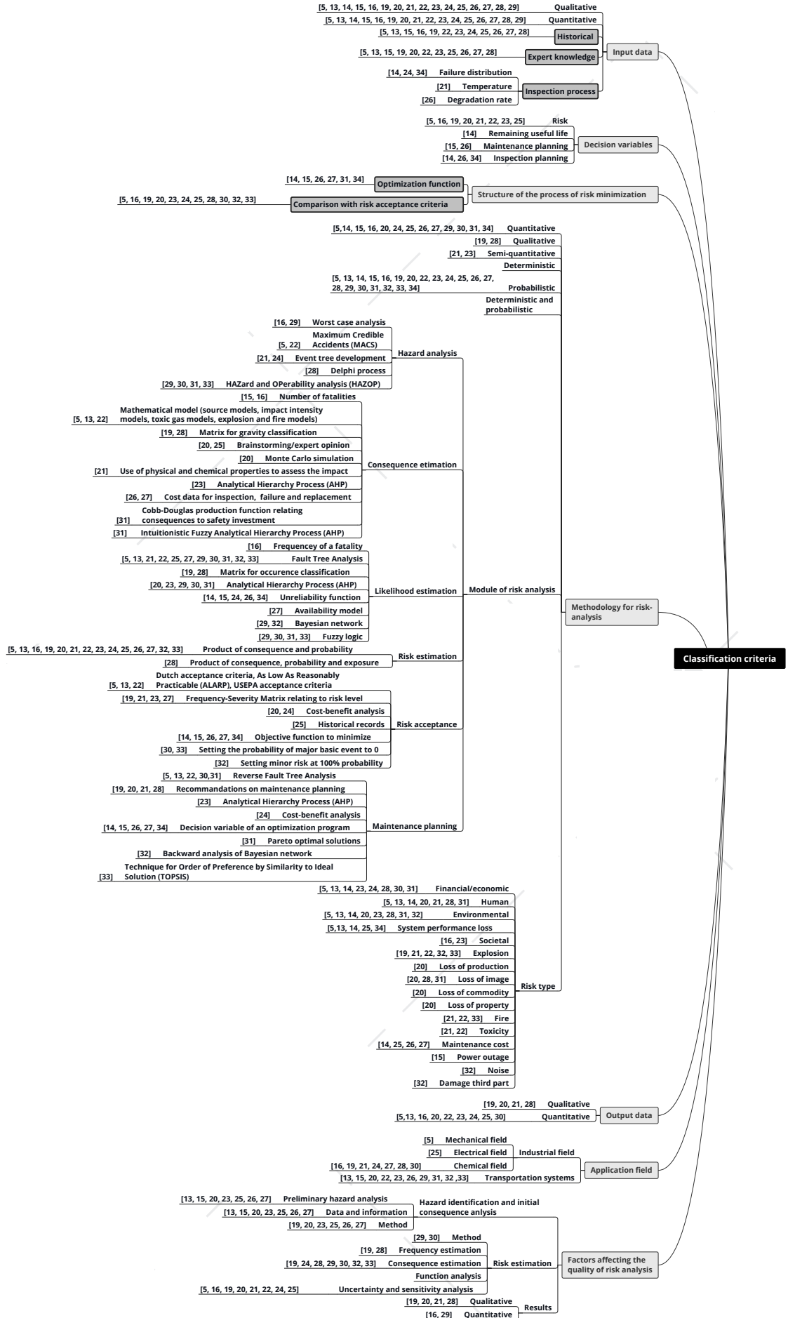
Fig. 2. Classification of risk-based maintenance methodologies according to criteria related to input/ output data, methodology used, type of application and factors impacting the quality of risk analysis