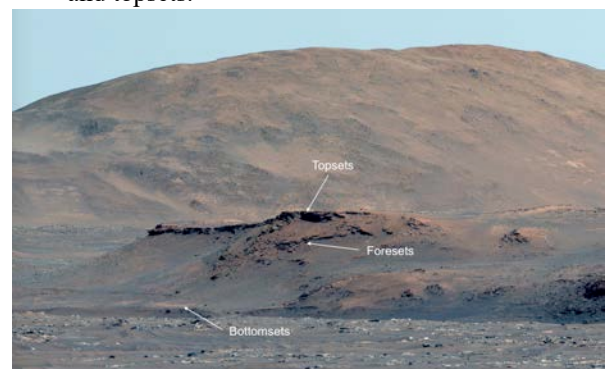
Fig. 2 Portion of Mastcam-Z of western fan. PIA25022 showing Gilbert delta geometry.