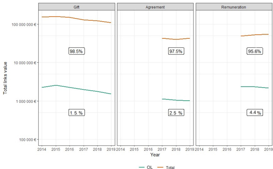
Figure 2 Evolution of the three kinds of financial ties for key opinion leaders (KOLs) and all physicians. The gifts declared for all physicians decreased in number and value over time; the number, the value and the proportion of gifts declared for KOLs decreased. The contractual agreements declared for all physicians increased; the number, the value and the proportion of contractual agreements declared for KOLs decreased. The remunerations declared for all physicians increased; the number, the value and the proportion of remunerations declared for KOLs decreased. OL, opinion leader.

The number, the value and the proportion of contractual agreements declared for KOLs decreased each year, from 4400 agreements (0.78% of the number of agreements with physicians)/€1.1M (2.6% of the value of agreements with physicians) in 2017 to 3500 agreements (0.64% of the number of agreements with physicians)/€1M (2.3% of the value of agreements with physicians) in 2019. This evolution is depicted in figure 2.