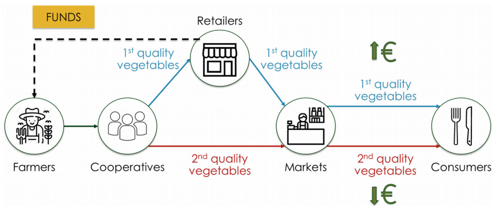
Figure 1. Agri-food supply chain under study

The supply chain under study is responsible for the production and distribution of multiple perishable vegetables with limited shelf-life. The shelf life of this vegetables is predetermined and once it has elapsed, the vegetable becomes worthless (Alemany, Esteso, Ortiz, Hernández, Fernández, Garrido et al., 2021). The considered supply chain is composed by farmers, cooperatives, retailers, and markets, who represent the demand of end consumers (Figure 1).