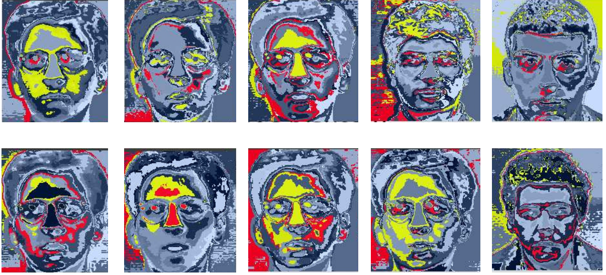
Figure 1: Application of the k -means algorithm to some image of face

Fig. 1 illustrates as well how the grouping of the different pixels of the image was carried out. After this step, each partition a corresponding histogram, then from the histogram derive the Markov chains, built the initial model and then we process to the training model.