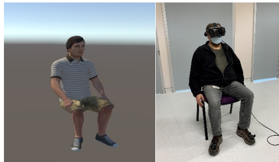
Figure 1. An avatar representing the user in an immersive virtual world. The experimenter can see the external view (left) while the user (right) see the virtual world at the first person.

In our pilot study, we first ask users, seated on a chair, to execute feet movements (ME) of their own choice (always the same), while we are recording the performed trajectories (see figure 1). Indeed, VR trackers positioned at the feet of the users enable us to capture, record and render on the VR avatar, the real movements made, in terms both of direction and amplitude, by the participants. This first step is designated as the warmup phase. In a second time, we ask participants to perform feet-MI task, by imagining the same movement as in the warmup phase. During this task, our final study will aim at comparing between three conditions: (1) Displaying the feedback using a state of the art modality, namely the so-called Graz visualization ; (2) Displaying an immersive feedback on the virtual avatar, unrelated with the previously performed movement ; (3) Displaying an immersive feedback on the virtual avatar, with a high fidelity to the previously performed and the imagined movement.